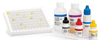
SHIGA TOXIN CHEK™