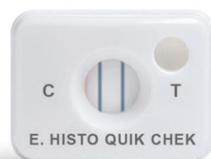
E. HISTOLYTICA QUIK CHEK™