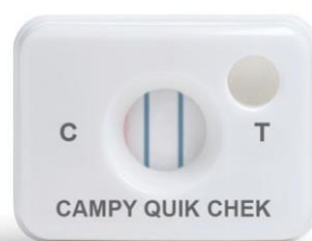
CAMPYLOBACTER QUIK CHEK™