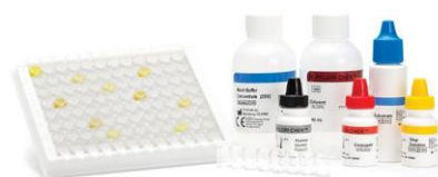
H. PYLORI CHEK™