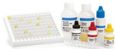
C. DIFF CHEK™-60