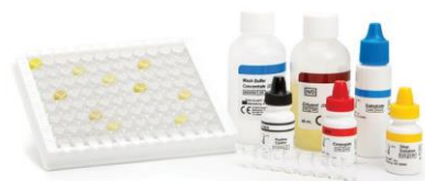
C. DIFFICILE TOX A/B II™