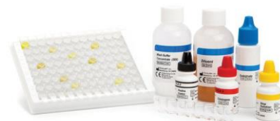
E. HISTOLYTICA II TM