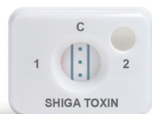
SHIGA TOXIN QUIK CHEK™