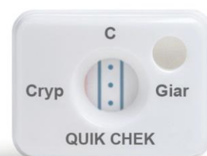
GIARDIA/CRYPTOSPORIDIUM QUIK CHEK ™