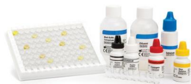
GIARDIA/CRYPTOSPORIDIUM CHEK ®