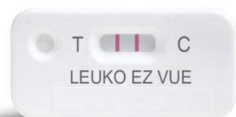
LEUKO EZ VUE®