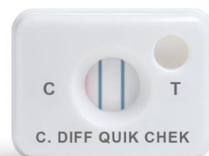
C. DIFF QUIK CHEK ®