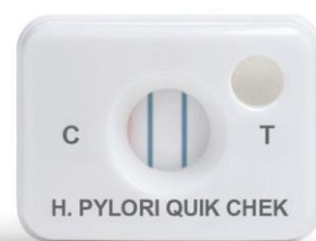
H. PYLORI QUIK CHEK™