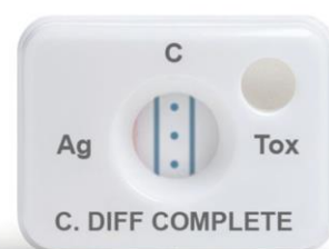
C. DIFF QUIK CHEK COMPLETE ®