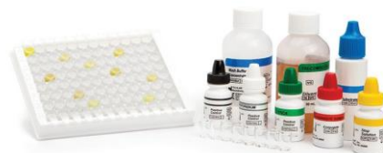
TRI-COMBO PARASITE SCREEN